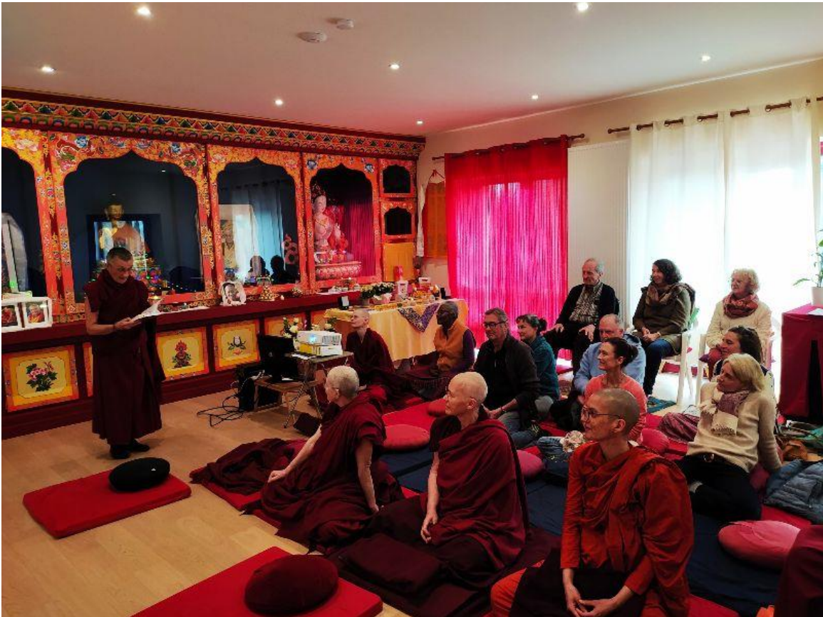
Se souvenir de Lama Yéshé avec la vénérable Lhamo

Finally, the getsulmas have regularly taken part in the Sojong ritual at Nalanda.