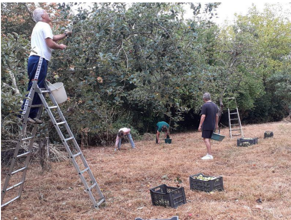
Picking apples in the orchards by volunteers of INICI

The summer of 2022 produced an impressive apple harvest! We found an association, INICI, all pensioners, who helped us with the picking and the whole process leading up to the production of a wholly ORGANIC apple juice . We took part in the bottling process, harvesting 150 bottles of a juice that everyone seems to appreciate.